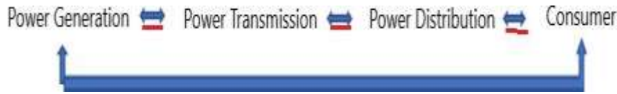
Fig.2: Power and the information flow in Smart Grid Here information flow is represented by blue color.